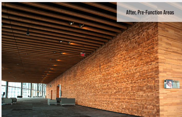
After, Pre-Function Areas

After: Controls were expanded to lighting on the upper two pre-function levels and are accessible via host computer, local touchscreens or tablet, enabling dynamic dimming and scene control.